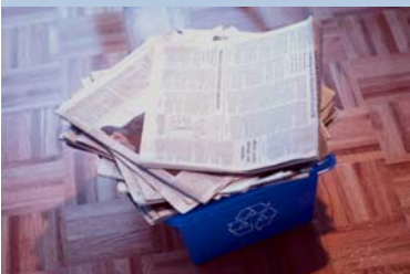
Place paper in marked recycling bins at your school

95 schools achieved their recycling targets for the fall 2006 semester. Each of these schools will receive an Office Depot gift card worth $277! To qualify for a reward during this semester, your school must recycle an average of at least 100% of its recycling target each week. You can find your school's recycling target and your weekly performance at: www.cps.edu/Operations/facility_operations.html