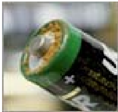
Consumer batteries can be recycled at all CPS schools