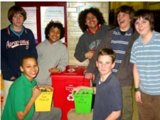
Clissold School's Recycling Club members participating in some of their recent activities

12 years ago, Clissold School formed a Recycling Club to collect recyclable materials and teach environmental awareness and responsibility. The Recycling Club meets once per week after school and is so popular that there is a waiting list to join.